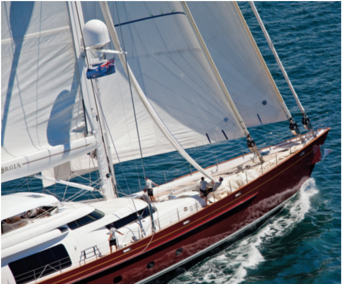
TOP LEFT: PRE-RACE CAPTAINS' BRIEFING TOP RIGHT: MID RACE ON BOARD JANICE OF WYOMING ABOVE: GEORGIA RACES AHEAD