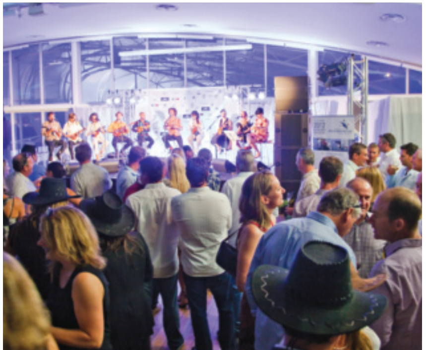
TOP: THE VICTORIOUS SILVERTIP CREW ABOVE: THE WELLINGTON UKULELE ORCHESTRA PERFORM AT THE GALA DINNER BELOW: HARBOUR VIEWS FROM THE CLOUD AT THE GALA EVENING