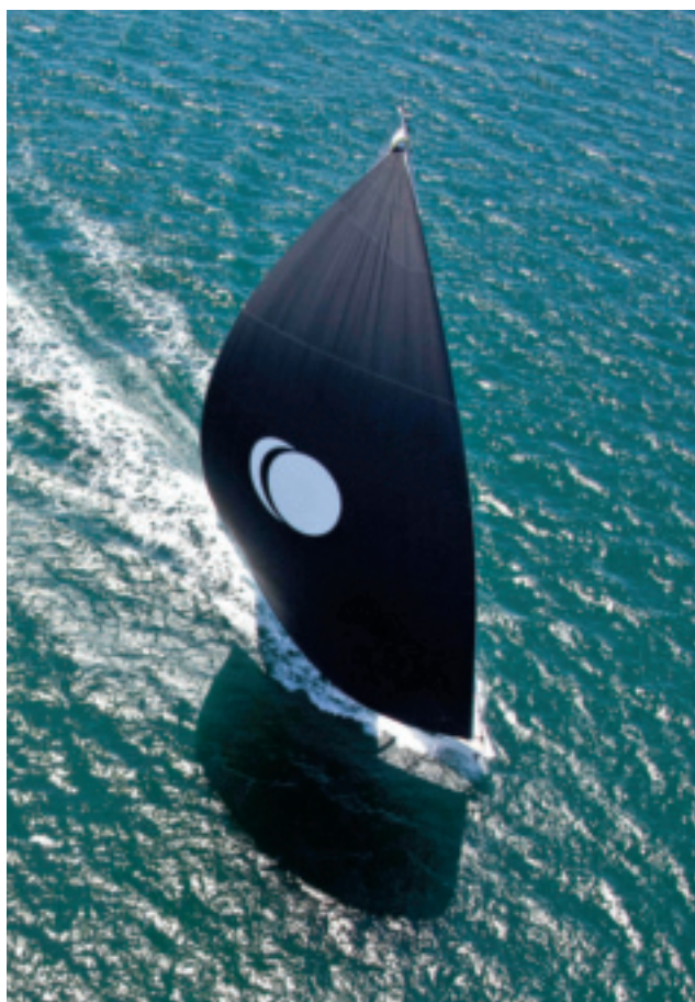
TOP: SILVERTIP PASSING JANICE OF WYOMING ABOVE LEFT: A BALANCING ACT ON BOARD GEORGIA ABOVE RIGHT: ECLIPSE UNDERWAY WITH HER SPINNAKER UNFURLED