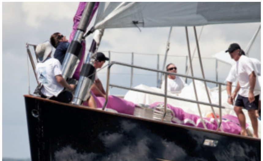
TOP: IMAGINE WITH HER SPINNAKER ON FULL DISPLAY ABOVE: RACE TEAM PREP THE SPINNAKER ON JANICE OF WYOMING