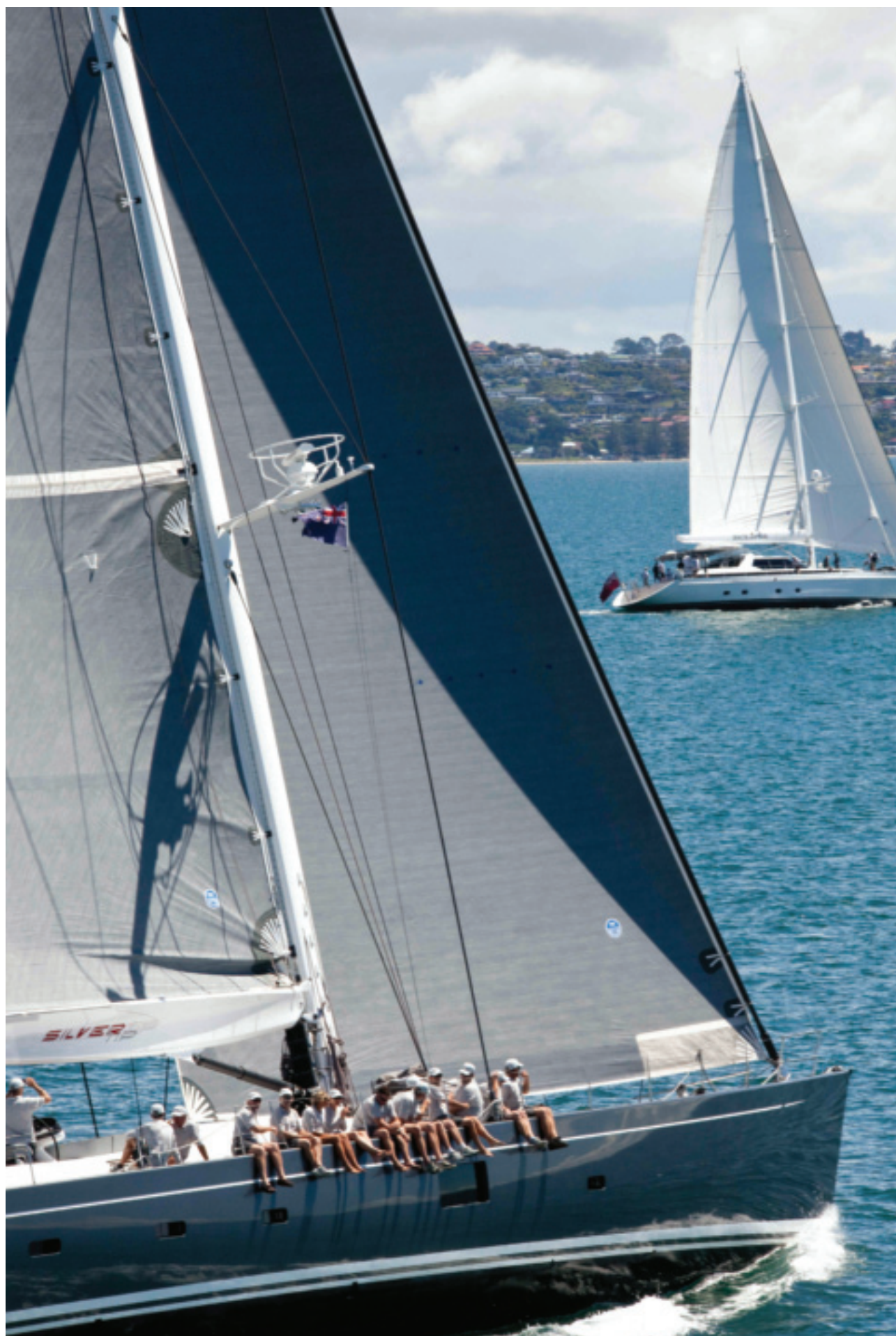
SILVERTIP GAINS ON ECLIPSE