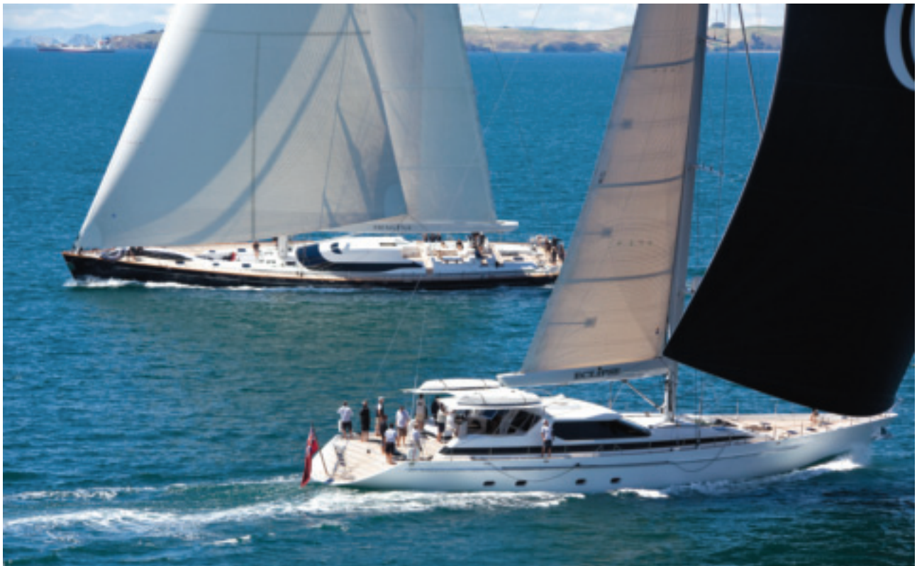
TOP LEFT: GEORGIA ON THE WATER TOP RIGHT & MIDDLE: ON BOARD SILVERTIP & RACE FLAG ABOVE: ALLOY-BUILT IMAGINE & ECLIPSE PASS BY EACH OTHER